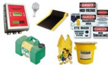
Deluxe Compliance Package

Protecting Mission-Critical Facilities and Personnel Since 1993. SM